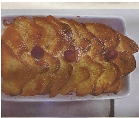
Our School Entry Peach & Raspberry Bread and Butter Pudding